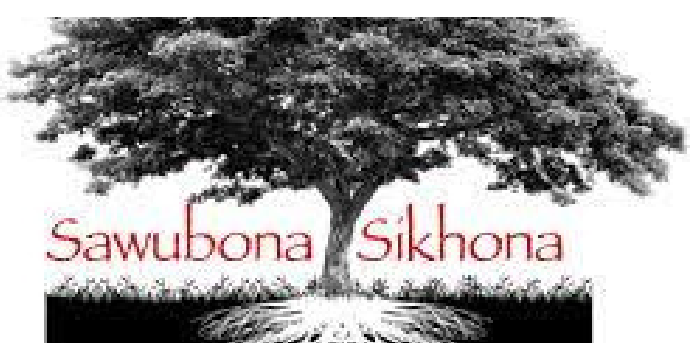
We are here to be seen. We see you!